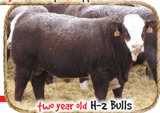
two year old H-2 Bulls

For hundreds of pictures, updates and video go to www.canadasbulls.com and find us on Facebook