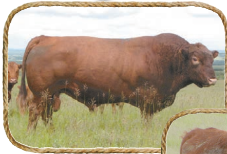
"Fleshy herdbulls with thickness and length"

Share and benefit from our experience and 40 plus years of selection, volumes of records, predictable birth weights and performance uniformity. Ranch raised Red Angus that'll do the job, never complain, and give you no grief. 75 solid bulls, buy one or you can select uniform half brothers in volume.