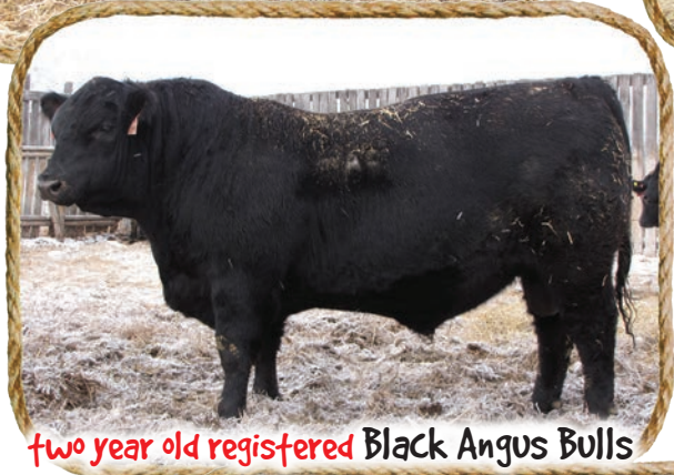
two year old registered Black Angus Bulls