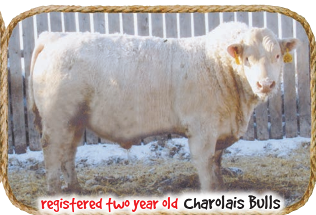
registered two year old Charolais Bulls