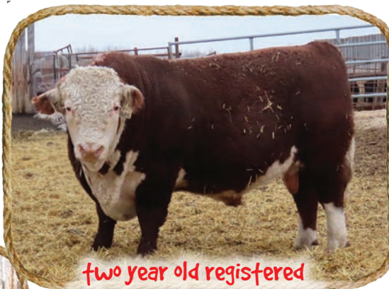
two year old registered Dehorned Hereford Bulls