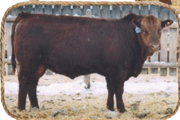
Summer Reds are the answer...

They're bigger, stouter and tougher than the yearlings you'll buy other places. They'll breed more cows, (even the big ones) hold their condition, take less management and be less worry and trouble. They've been gently and slowly developed on grass, so they last a long time in your herd. They'll breed circles around a yearling and they're not the "leftovers" like many 2 year olds you'll find. They really are the answer. "Perfect Age" bulls - 22-26 months old at breeding time. WHY BUY YEARLINGS WHEN YOU CAN HAVE THESE AT NO MORE MONEY?