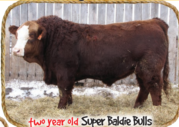
two year old Super Baldie Bulls