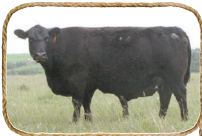
Fleshy, broody cows

Ours are easy fleshing Black genetics, yet they still have frame and length. Just like our Red Angus, our Blacks are light at birth, then really grow when it counts. Angus convenience , the black color and no darn trouble. We're your best Black bull opportunity. All older bulls, bigger, stouter and tougher than yearlings . Why go anywhere else. 70 powerful bulls, amazing uniformity, big groups of half brothers. Impressive and affordable.