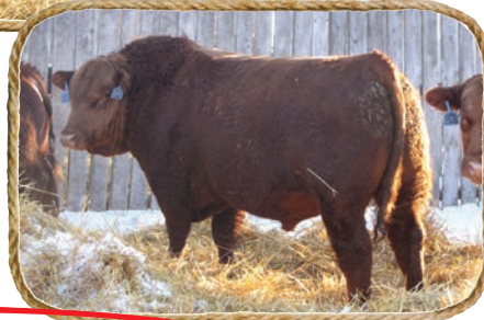
"In the 20+ years we have been doing business together (sight unseen and at the auction) there has never been a bad bull from you. In Northwest Cattle's eyes, there is only one bull breeder in Canada to buy from!"