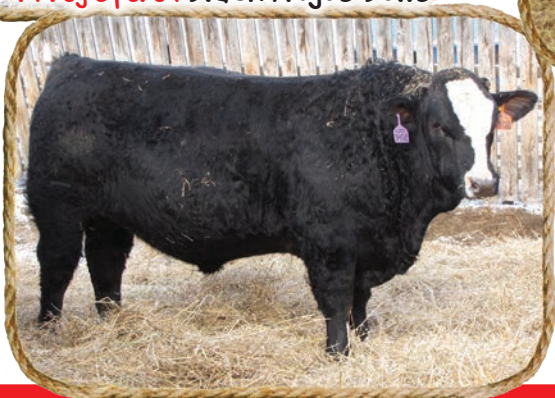
two year old Black Super Baldie Bulls

For hundreds of pictures, updates and video go to www.canadasbulls.com and find us on Facebook