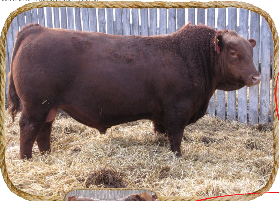
"I bought 3 red angus bulls for heifers and was very pleased with the Calving Ease and temperament of the bulls. Bulls breed well over 200 plus heifers, no complaints, no calving issues." -P. Fofonoff, SK