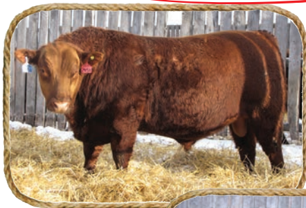
75 Summer born 2 yr. olds sell!

They're bigger, stouter and tougher than the yearlings you'll buy other places. They'll breed more cows, (even the big ones) hold their condition, take less management and be less worry and trouble. They've been gently and slowly developed on grass, so they last a long time in your herd. They'll breed circles around a yearling and they're not the "leftovers" like many 2 year olds you'll find. They really are the answer. "Perfect Age" bulls - 22-26 months old at breeding time. WHY BUY YEARLINGS WHEN YOU CAN HAVE THESE AT NO MORE MONEY?