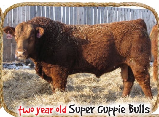
two year old Super Guppie Bulls