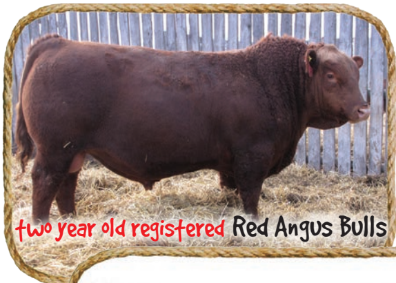
two year old registered Red Angus Bulls